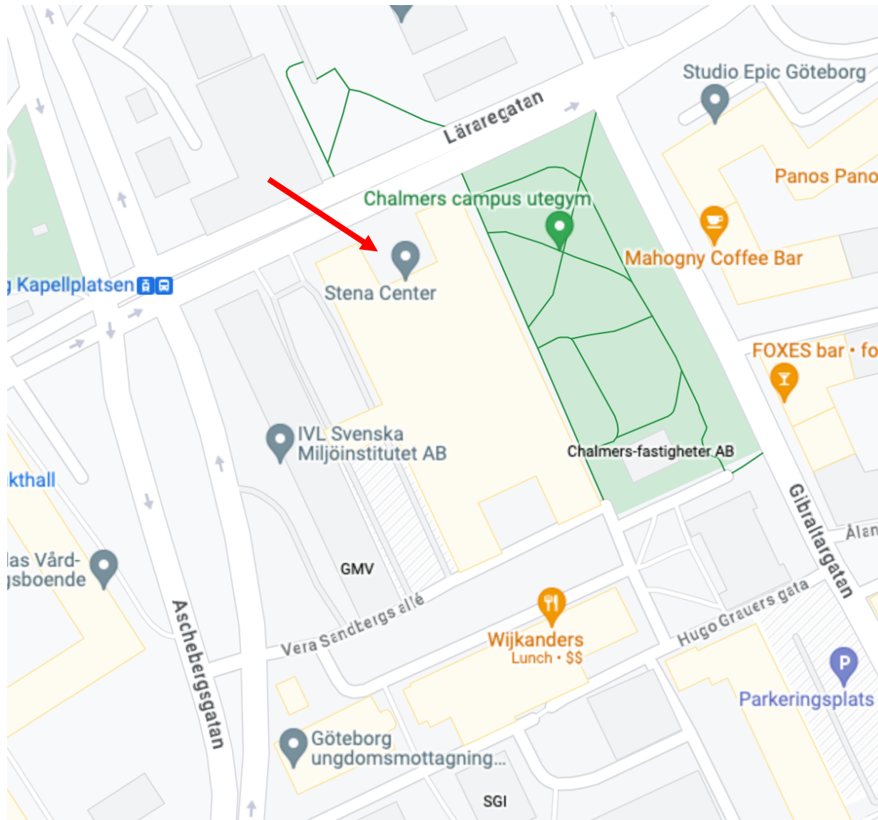
Veras Gräsmattan is in the Stena Center